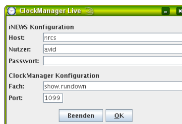
Figure 2: ClockManager Live - Initial Screen

The Port means the Java RMI port. 1099 is the standard port. If this port is already in use, choose another free TCP port here.